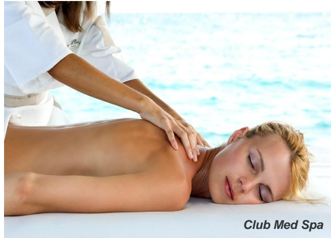
Club Med Spa